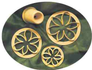
Bridal Lily Set

This set consists of three sizes of flower Cutters plus a former, making it ideal to create a range of different flowers.