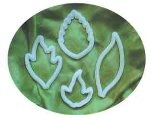
Creative Leaf Set

These four different shaped leaves will create a wide range of foliage & therefore are an ideal set to compliment the versatile Bridal Lily