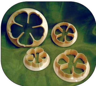
Five Petal Rose Cutters

See the FMM Catalogue for the full range of products.