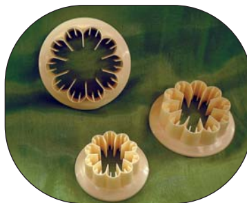
Quick & Easy Carnation Cutters