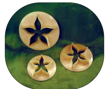
Rose Calyx Cutters

F.M.M. Products are widely available. Contact your local stockist or F.M.M. for further information.